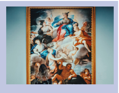
Fine art (per item): $100,000